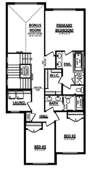
SECOND FLOOR PLAN (OPT. REAR BONUS ROOM) 1131 Sq.Ft.